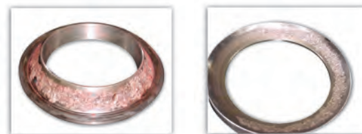
Circulating Water Pump bearing/race as found after APR notification of abnormal conditions